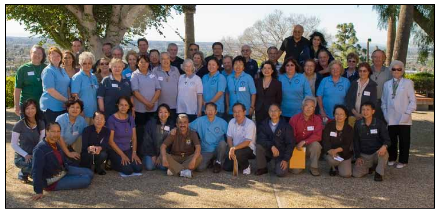
Assembled Ministers and the Regional Executive Council of the St. Francis Region at the Ministers' Meeting and Regional Election, January 16-18, 2009

All of the ministers of St. Francis Region (or their delegate) gathered from January 16-18, 2009, at Marywood, for a Chapter of Elections (the annual ministers' meeting).