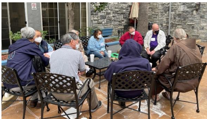
Meeting of Spiritual Assistants