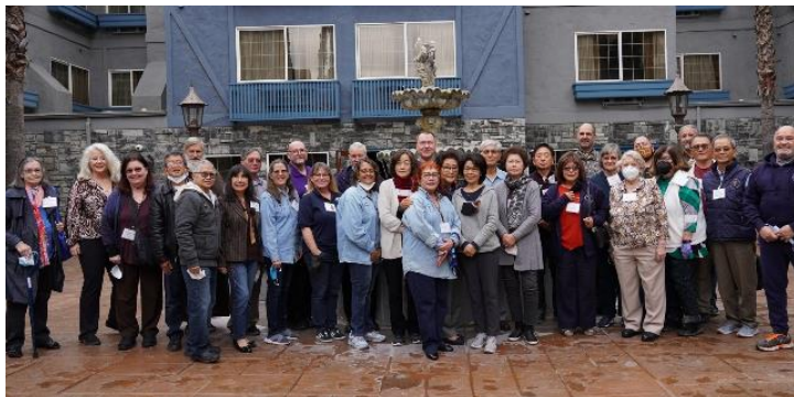
All attendees: Fraternity Ministers, Delegates, Regional Executive Council, & Spiritual Assistants