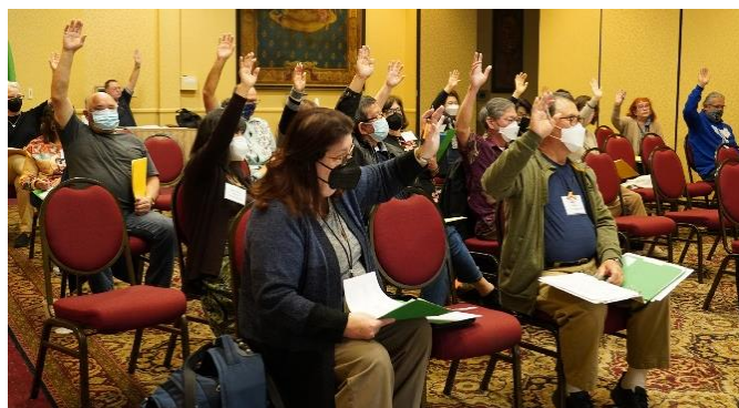
Ministers and Delegates voting.