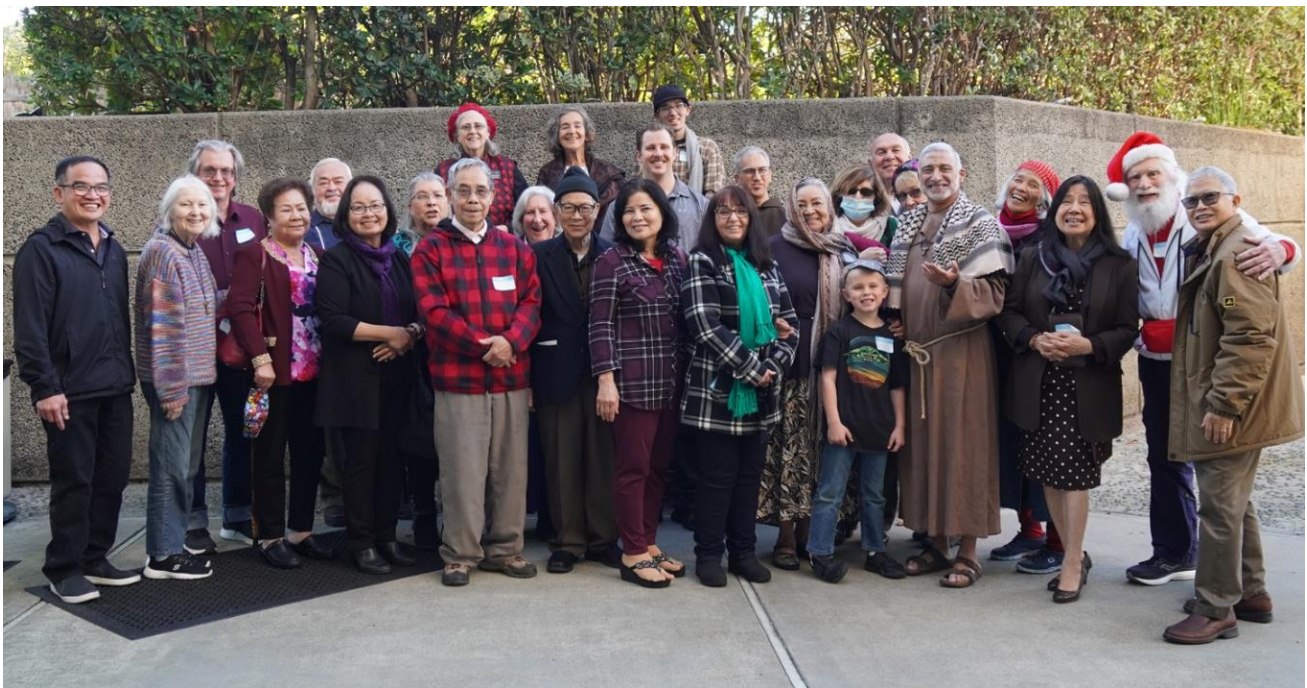
Immaculate Conception Fraternity, St. Anthony of Padua Fraternity, and Visitors celebrated together.