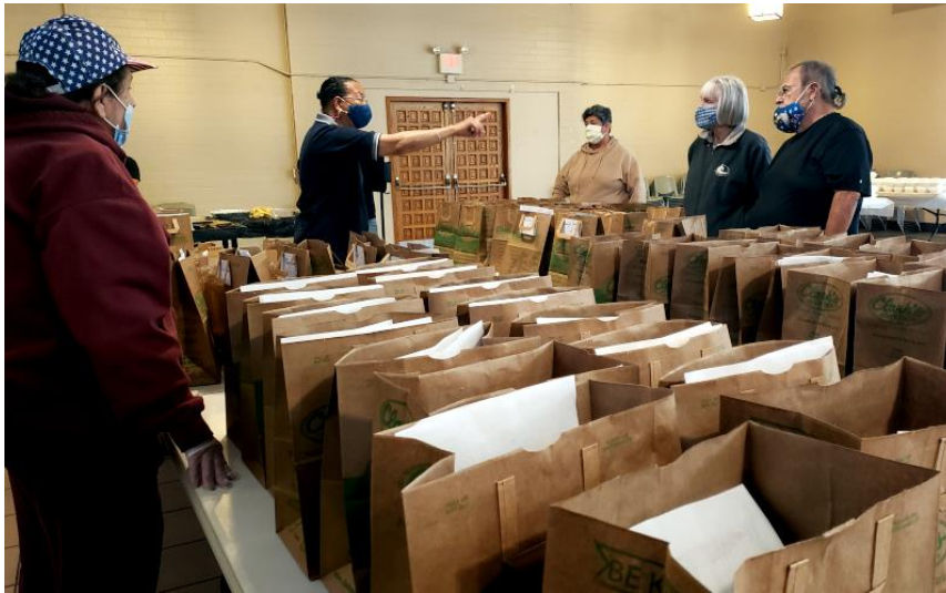
Meals awaiting Distribution

Holy Spirit Fraternity members prepared gifts for four families for Christmas.