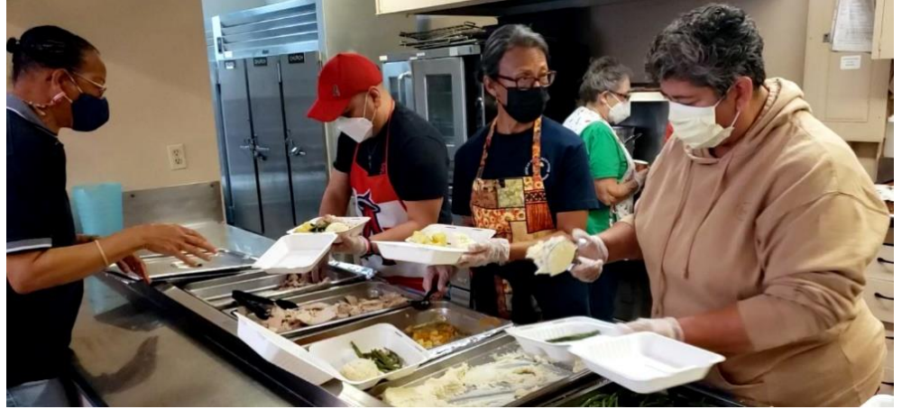
Putting the meals together

We coordinated a Thanksgivings Day meal for the lonely, drive through this year. After we distributed the meals that were requested, we were able to share the extras with Volunteers of America food distribution.